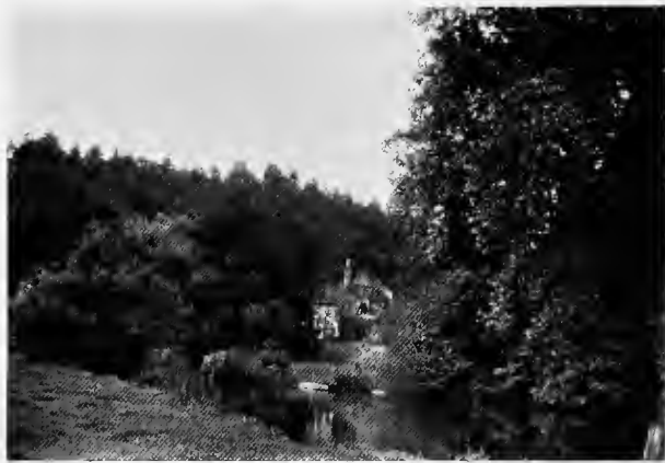
A VIEW AT MOOR PARK, SURREY Stella's Cottage in the distance